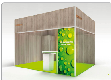
Shell scheme Premium (sample finish „light oak“)