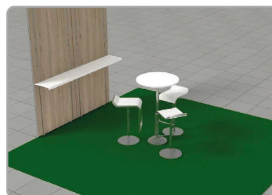
Furniture Package A 1 high table, 3 bar stools, 2 shelves